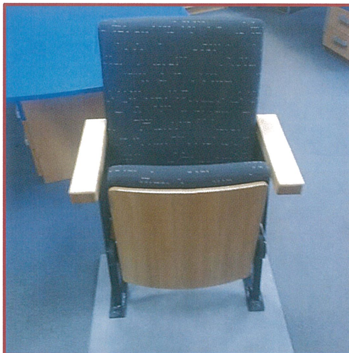
Photo 1 – Folding seat for cinemas and theaters, the LIBERTY model